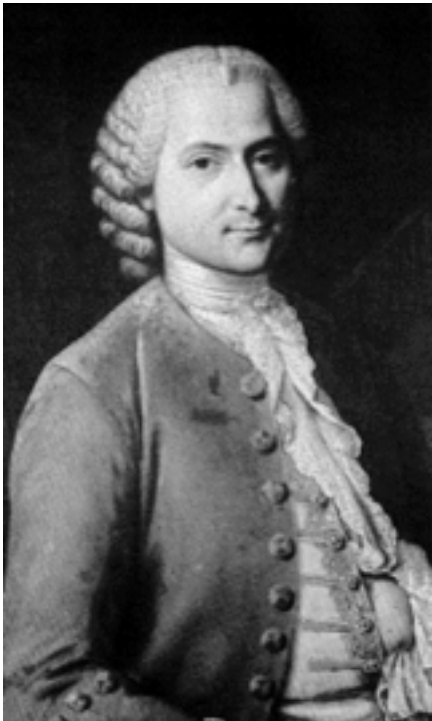
Jean Jacques Rousseau

‘To find a form of association which may defend and protect with the whole force of the community the person and property of all its members and by means of which each, coalescing with all, may nevertheless obey only himself, and remain as free as before. Such is the fundamental problem of which the social contract furnishes the solution.’